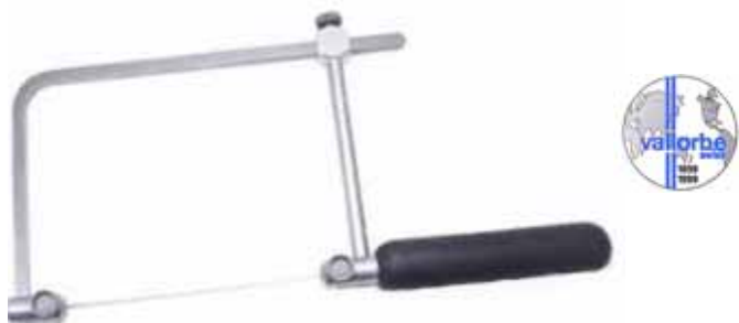
Ref: 31-503-000 Adjustable 100mm deep 180g.