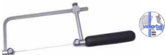
Ref: 31-502-000 Adjustable 70mm deep 156g.