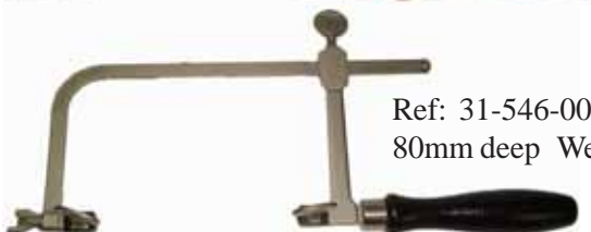
Ref: 31-546-000 Adjustable 80mm deep Weight: 168g