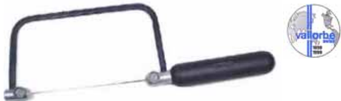
Ref: 31-501-000 Fixed Sawframe 75mm deep 116g.

Made in Switzerland from high quality spring steel.