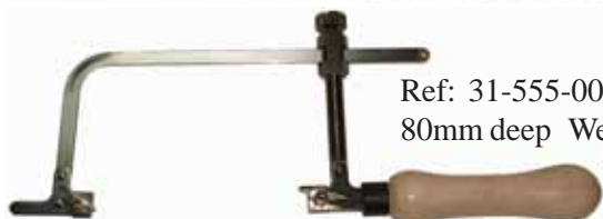
Ref: 31-555-000 Adjustable 80mm deep Weight: 197g