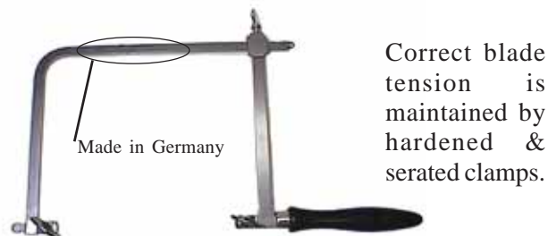
Ref: 31-550-000 Adjustable 150mm deep 205g.