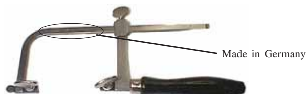
Ref: 31-505-000 Adjustable 60mm deep 136g.

Made in Germany to a consistently high level, these sawframes have, for many years been, the benchmark for jewellers and jewellery apprentices alike. Solidly built and well balanced they perform reliably for many years, making them excellent value at a modest price. Easily recognised by the glossy black, comfort-shaped wood handle and flat steel construction (don't get caught with a cheap copy, check for the Made in Germany stamp).