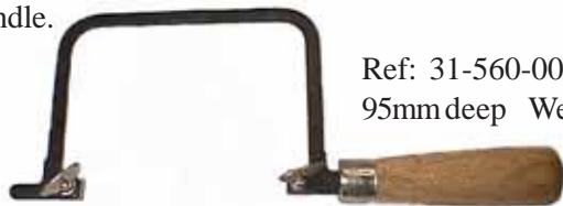
Ref: 31-560-000 Fixed 95mm deep Weight: 143g

Well designed, balanced with a comfortable hardwood handle.